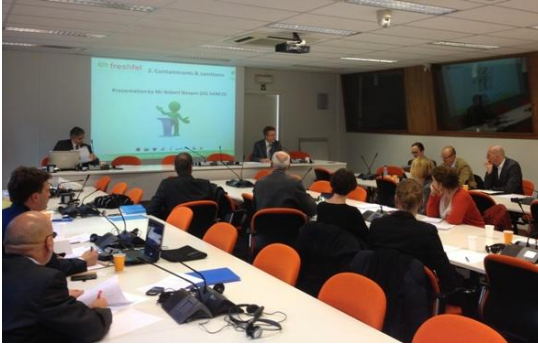
More than 30 participants were at Freshfel's Food Safety and Sustainability Working Group

The Freshfel Food Safety and Sustainability Working Group met on 3 December 2013. More than 30 participants from the fruit and vegetable sector and the European Commission attended. Several speakers from the European Commission gave participants a roundup of the recent plant health issues relevant for the fresh produce sector. Among them were discussions on plant protection products, contaminants, citrus black spot (CBS), the EFSA evaluation on microbiological issues for different kinds of fruits and vegetables, and several other issues.